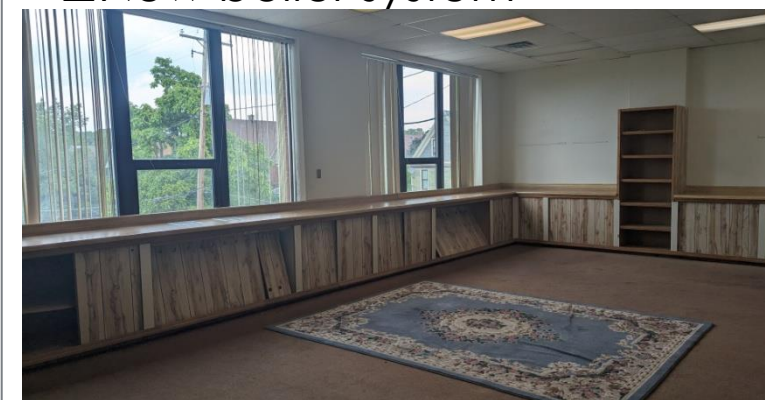
Second floor classroom