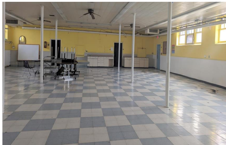
Lower Level with commercial kitchen