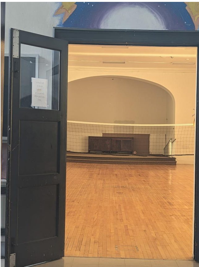
First floor entry into large space