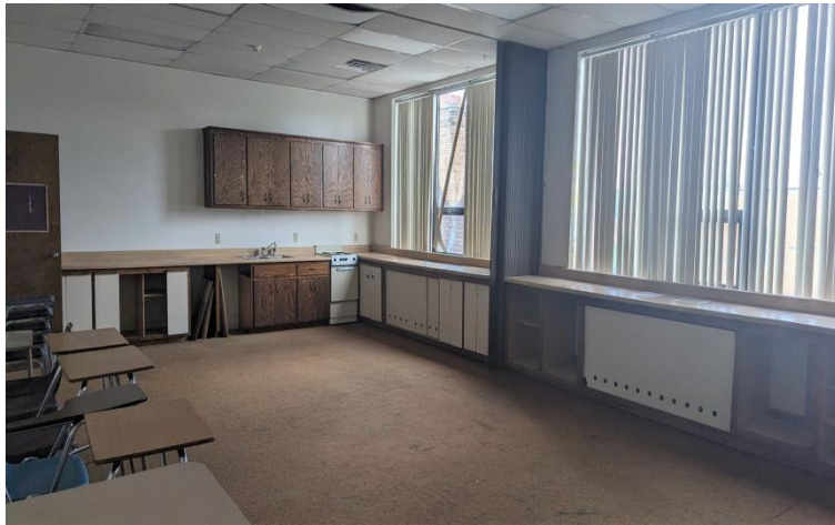
Upper level classroom